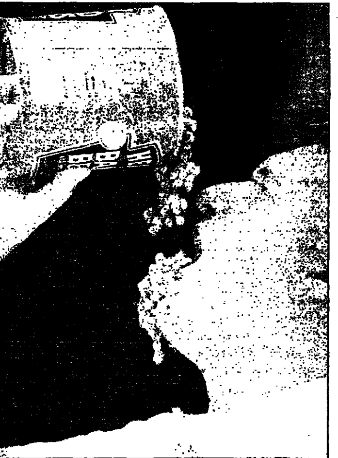
It's not the first time London was blitzed from the air. A baked-bean eating contest, which raised funds for charity, challenged contestants to eat as many beans as they could — one at a time — in five minutes. In this photo, bean lover Bill Currie warms up with a taste of what's to come.